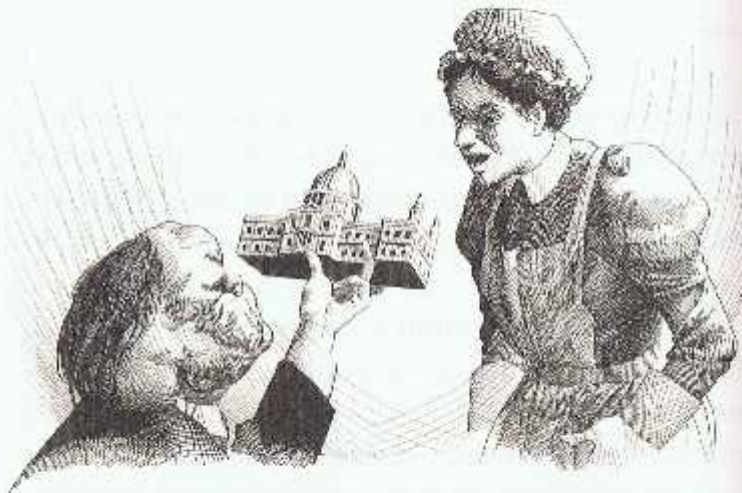
Sometimes he makes things with his hands and gives them to the nurses.

The readers of The Times are very kind people. They gave us a lot of money. After one week, we had £50,000, so Merrick could live in the hospital for all his life. We could give him a home.