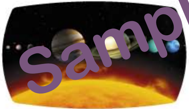
the solar system