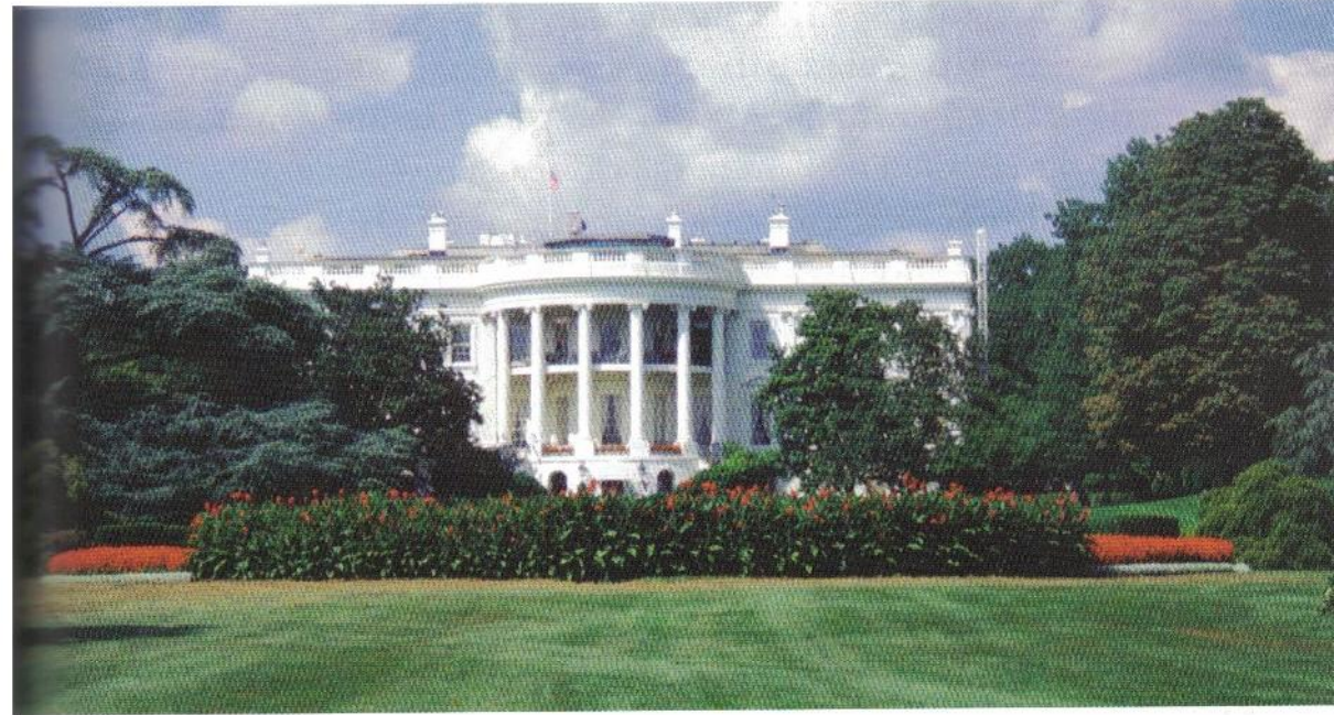
The White House in Washington D.C.

On 5 April 1865 Abraham Lincoln had a very bad dream. He was at the White House and he heard people crying in the next room. He got up and went to the East Room. He saw a coffin 1 in the middle of the room. Many people walked by the coffin.